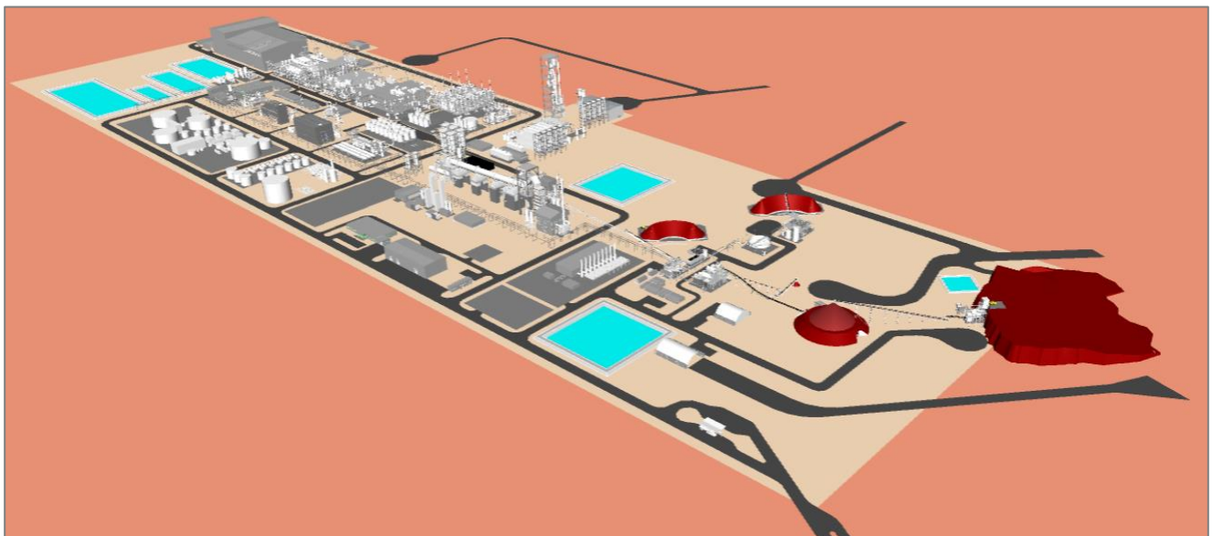
Figure 1: TNG's new Mount Peake Project integrated operation layout (south-east view)

Australian resource and mineral processing technology company TNG Limited (ASX: TNG ) ("TNG" or "Company") is pleased to advise that an integrated design layout for the Company's flagship Mount Peake Vanadium-Titanium-Iron Project ("Mount Peake Project" or "Project") in the Northern Territory, Australia, has been developed and delivered by Australian engineering and construction company, Clough Projects Australia Pty Ltd ("Clough").