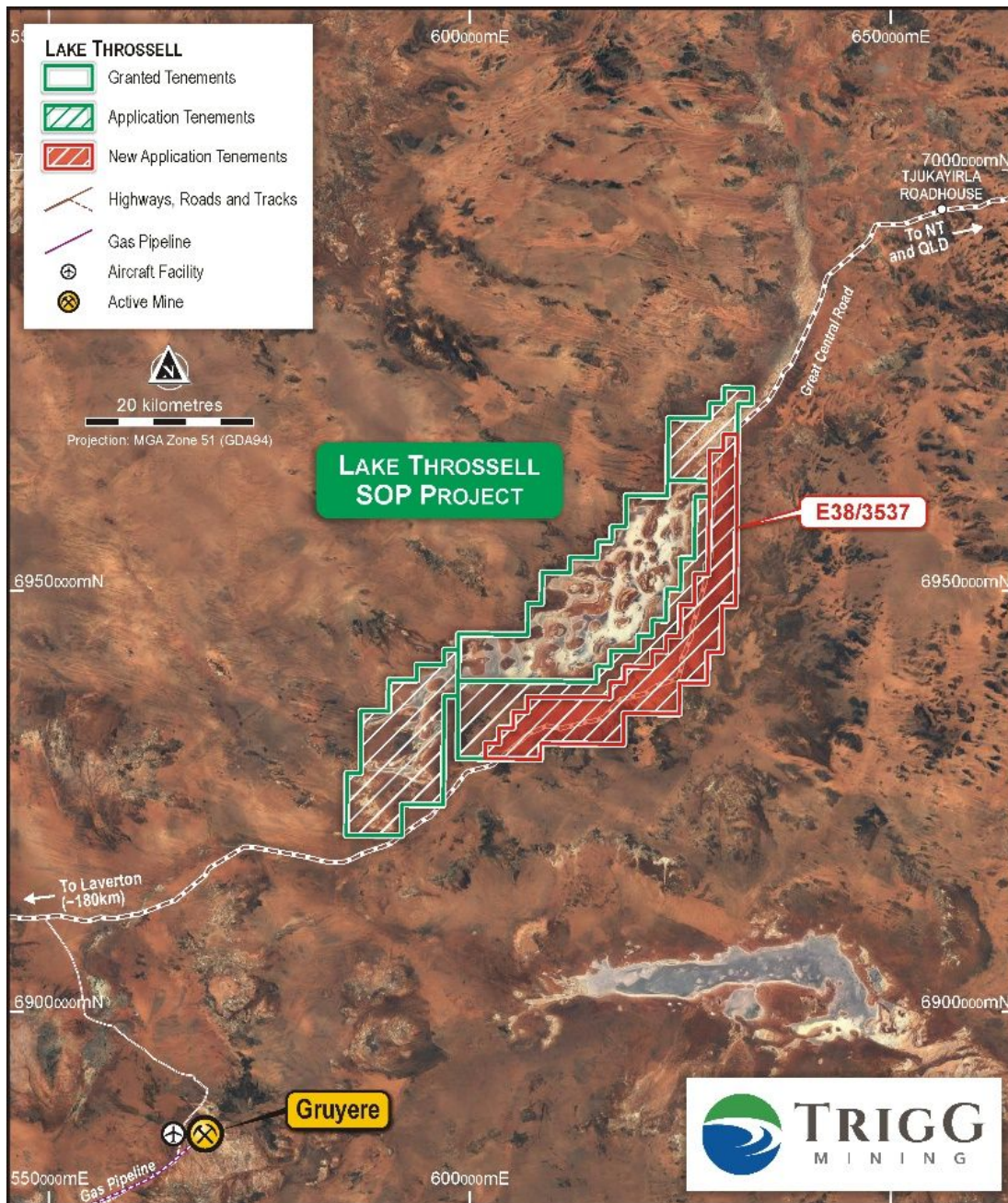
Figure 1: Extended Lake Throssell SOP Project, show the new tenement application.

The planned maiden air-core drilling program to test the palaeochannel defined by the recent gravity survey (Figure 2) is on track to commence next week and has been designed to drill the extent of the palaeochannel within the existing granted tenement E38/3065.