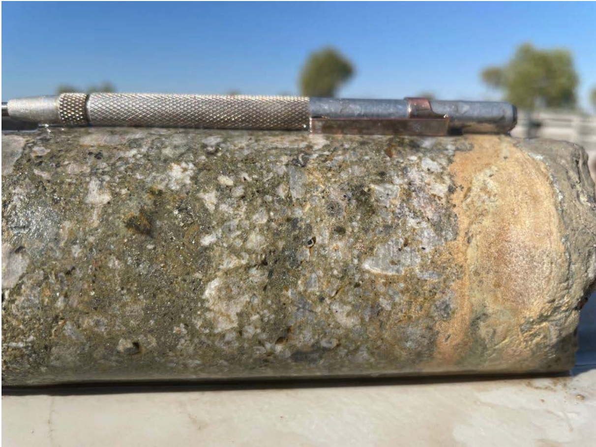
Figure 3: CDX0007 123.5m massive orange monazite forming on lower contact of a primary sulphidic carbonatite breccia within a larger 75m fault breccia

The diamond drill holes have confirmed the geological model and surprised the RareX geology team with the larger-than-expected fault systems encountered. Diamond drill holes will now test the mineralised zones at depth. Drilling at different orientations is also planned to firm up the geological model.