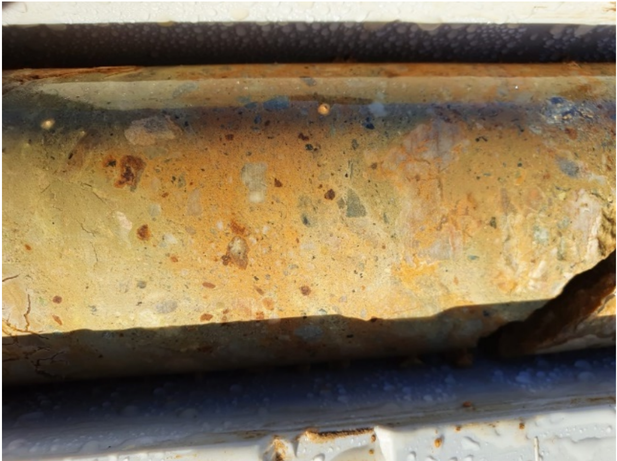
Figure 2: CDX0004 Example of oxidized polymictic breccia

This fault breccia is located where a displacement fault is interpreted in the new geological model. Surrounding drill holes to CDX0004 are well mineralised, indicating that the fault breccia is the source of the REE mineralisation in this area. This presents strong exploration upside with an unrecognised wide mineralised structure to test at depth.